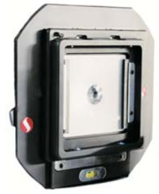
DF7020 6x6 Live-Video adapter with Hasselblad V interface + D7016 Hasselblad Type screen in metal frame 6x6 + Lupe 4x