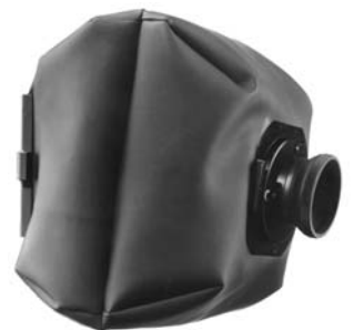
code 4050 Folding Hood for 4x5 inches Back