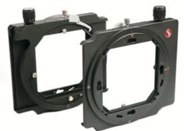
Shiftable rings 15+15mm

The extension rings are used to adjust the different lengths of the lenses. The rings n.1 and n.2 are also available in the shiftable 15+15mm version, which are useful to increase the rise or to combine the rise with the side shift movement.