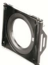
3300 Wide Angle Filter Holder 100x100mm