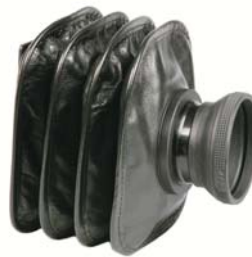
code 5020 Magnifying glass in leather Bellow for 6x12