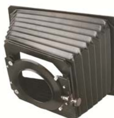
3200 Wide Angle Filter Holder 75mm 3300 Wide Angle Filter Holder 100mm