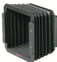
3205 Bellow Filter Holder Combination 75mm 3305 Bellow Filter Holder Combination 100mm