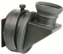
code 5030 Adjustable Reflex viewer 6x9 for 6x7/9cm backs